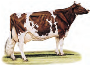
Red & White